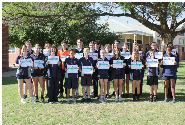
1 - Term 1 Secondary GROW Awards Assembly