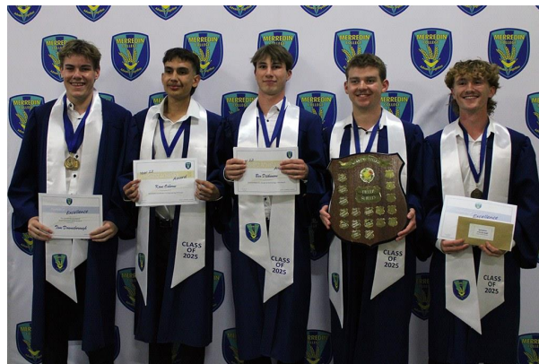
1 - Year 12 Awards Presentation Evening