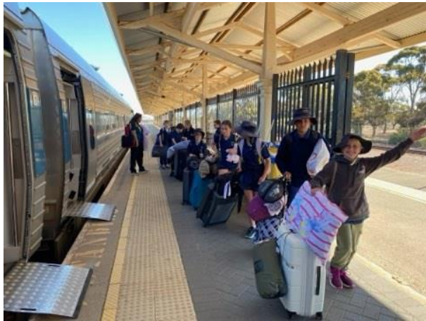
Primary Interschool Athletics Carnival