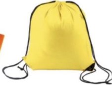
Sports Bags $10