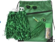
Bundle Packs available

See over for colour availability more colours & styles available online