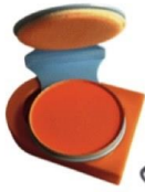
Hair Chalk $4.50