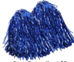
Pom Poms (2pc) $5