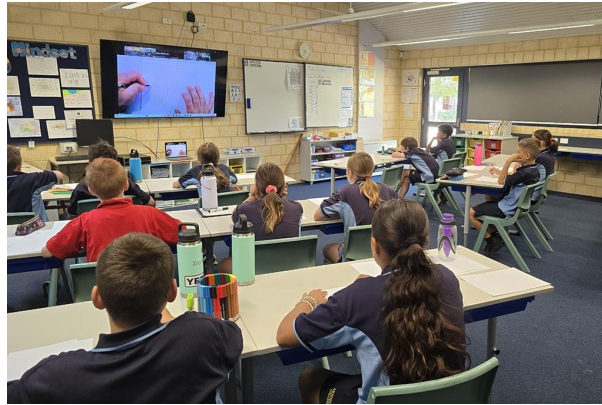
3 - Bringing Characters to Life