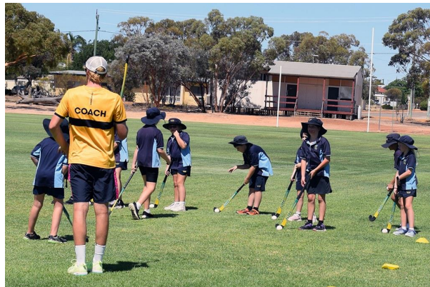
4 - Primary Hockey Clinic