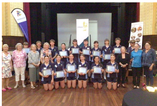
3 - Year 9 Students helping out at the Merredin Seniors Luncheon