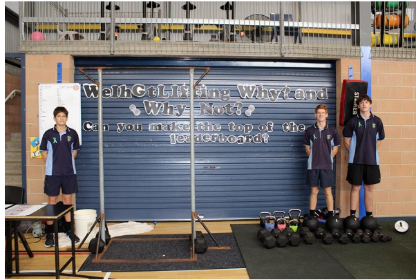
4 - Year 10.2 Health Expo