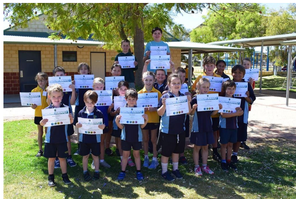
2 - Primary Grow Award Winners - Week 4