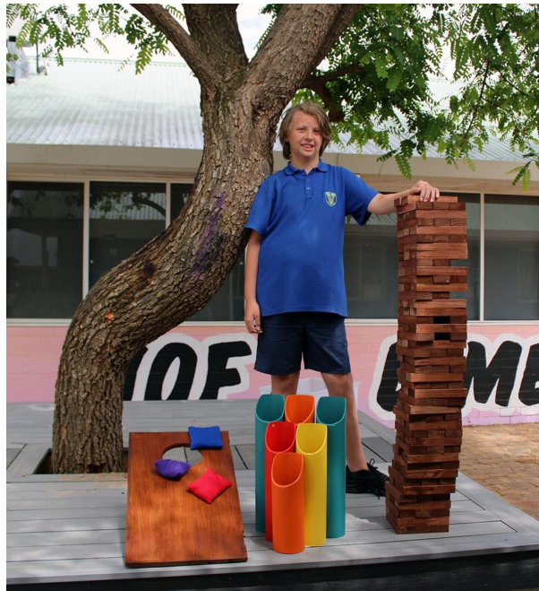
1 - Pallet Projects students completed a Giant Jenga Set for the Year 7 Quad