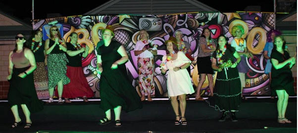
Year 7-10 Highest Achievers Assembly