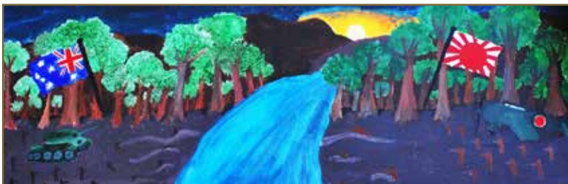
Secondary students displayed some outstanding items of work completed to commemorate ANZAC Day!