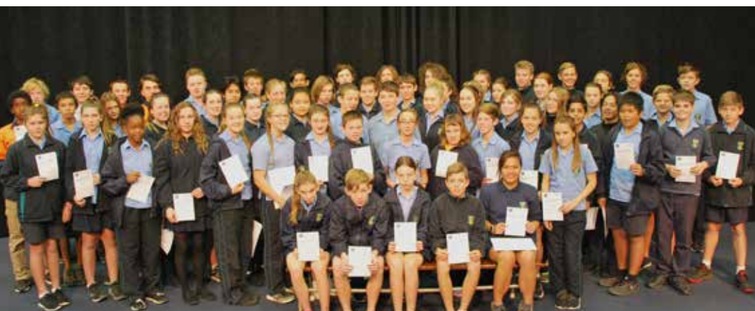
SECONDARY 100% ATTENDERS IN TERM 1